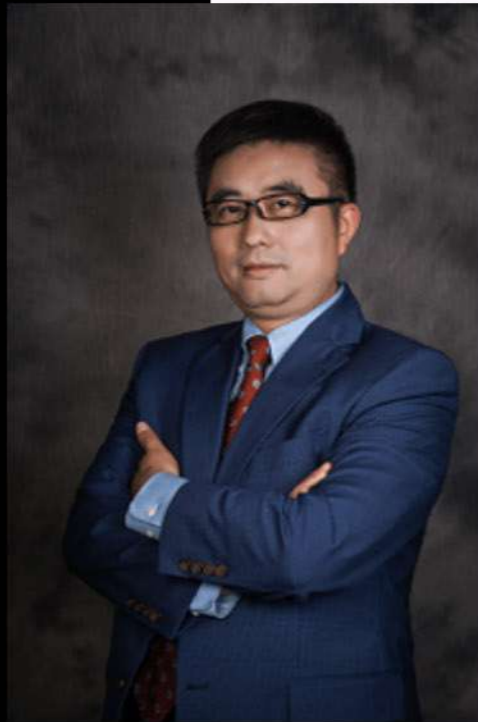
William Wu Shanghai Congress Senator